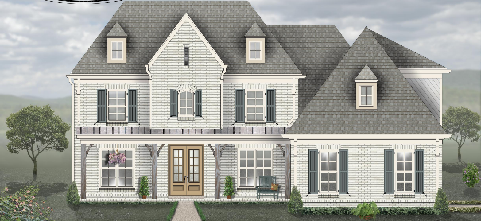
Photo or Rendering May Reflect Changes Made in Field.

SQUARE FOOTAGE 2420 HEATED DOWN 1126 HEATED UP 498 GARAGE & STORAGE 218 FRONT PORCH 252 OUTDOOR LIVING AREA